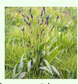
Spear-shaped leaves at base, compact flower heads