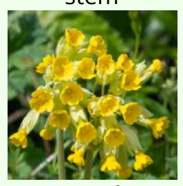
Cowslip Low green crinkly leaves, upright stems & clustered yellow flowers