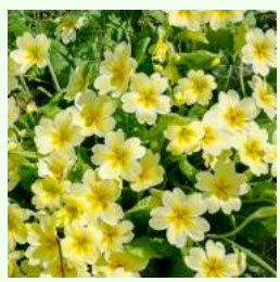
Primrose Low-growing, rough ongue-shaped leaves, large creamy flower with vellow centre