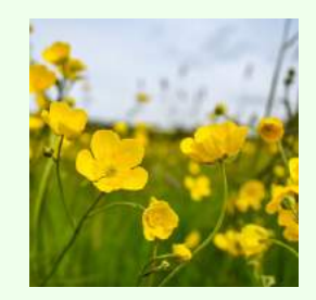
Meadow Buttercup Yellow flowers of 5

shiny petals, rounded leaves, smooth stems