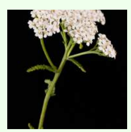
Yarrow White flat-topped heads in clusters, hairy leaves